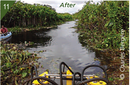
8. The fork in action. 9. Deposit zone for water hyacinth. 10 and 11. Photos of the colonised channel before and after the work.