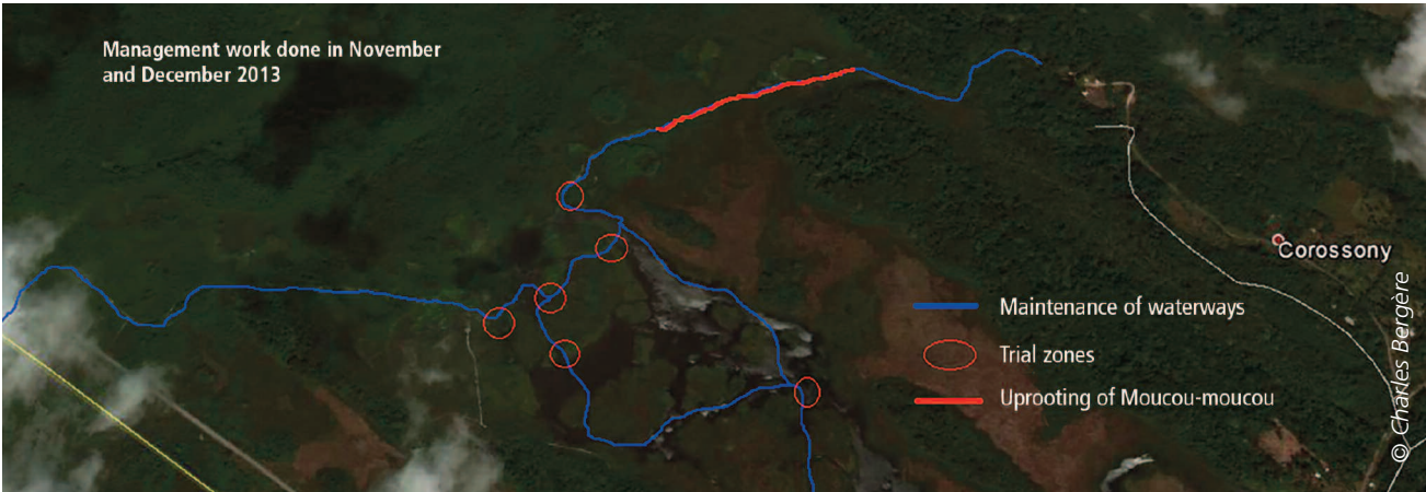
Work sites in November and December 2013.