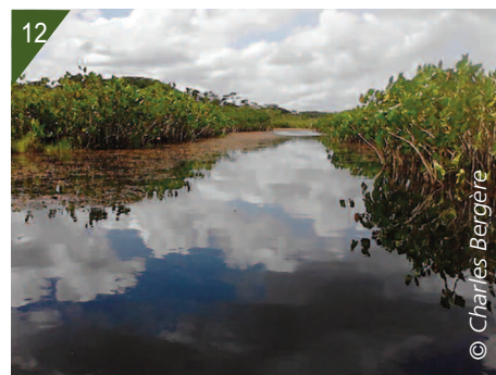
12. A channel cleared of invasive plants.

( https://professionnels.ofb.fr/index.php/en/node/416 )