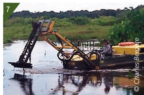
3. Floating leaves of the Cabomba aquatica plant. 4. Water hyacinth ( Eichhornia crassipes ). 5. Bladderworts ( Utricularia foliosa ). 6. Moucou-moucou ( Montrichardia arborescens ) along the edges of channels. 7. The cutting bar in action.