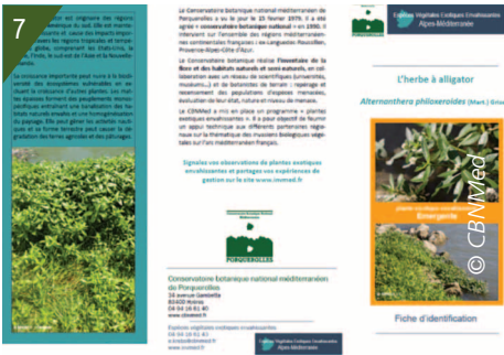
6 - Training session on how to identify alligator weed. 7 - Part of the fact sheet used to identify the species.