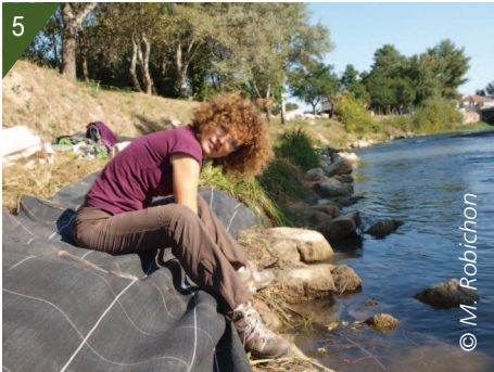
5. Installing the tarp.

■ In the tarped area, the surface area covered by the species dropped continuously, from 87% in 2016 (surface area prior to uprooting) to 37% in September 2017 (when the tarp was changed) and to 16% in 2018. The remaining plants had wilted and were in the process of dying. It should be noted that the tarp led to the virtual disappearance of all vegetative components of the species present, both native and alien, and resulted in bare soil.