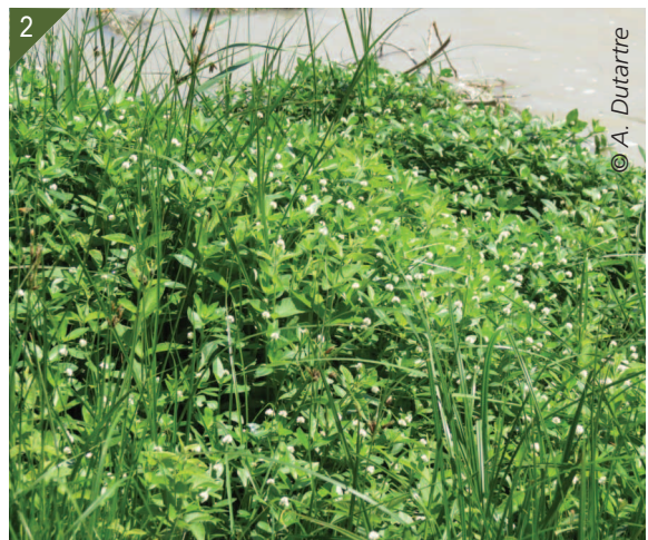
1, 2. The site of the alligator weed on the right bank of the Ouvèze River.

■ The species can form dense, single-species beds that severely affect native species and modify the landscape.