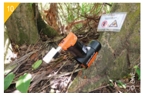
8 - Informational caravan for the conservation of sea turtles during an event in Sainte-Anne. 9 - Sign posted at beaches where trapping was under way to inform the public on the management work. 10 - A Goodnature A24 trap attached to a tree.