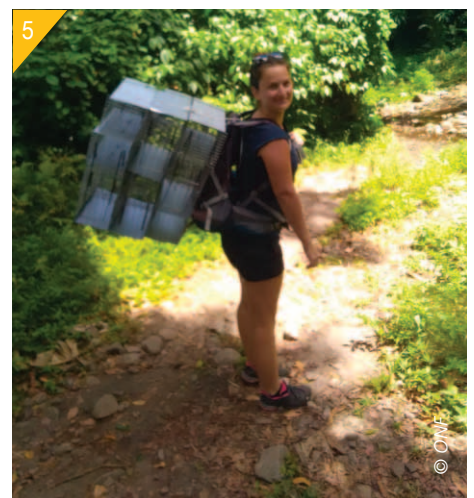
2 - A small Indian mongoose attacking a sea-turtle nest. 3 - Predation on a sea-turtle egg. 4 - A mongoose cage trap (old model). 5 - Transporting the cage traps to the nesting sites.