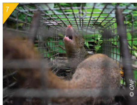
6 and 7 - A small Indian mongoose captured in the custom-made cage trap.