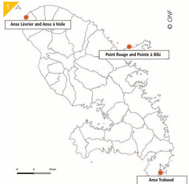
1 - Map showing the beaches where the work took place