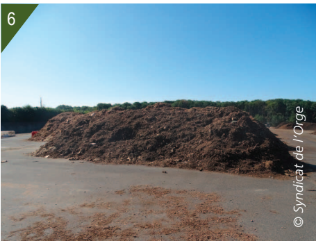
4 - Depositing the knotweed waste. 5 and 6 - Chopping and placing in mounds.