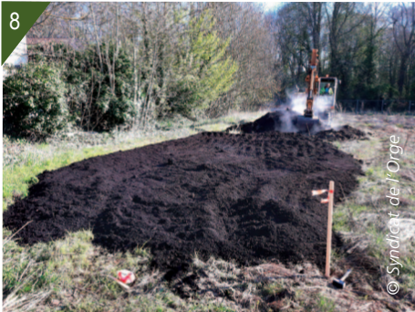
Spreading of the Asian-knotweed compost. 7 - Compost simply spread on top of the soil. 8 - Compost mixed with the underlying soil.