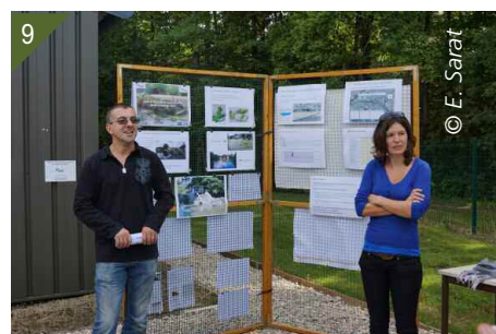
8. 9. Efforts to raise awareness in the field.