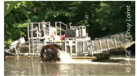
7. Harvester boat.