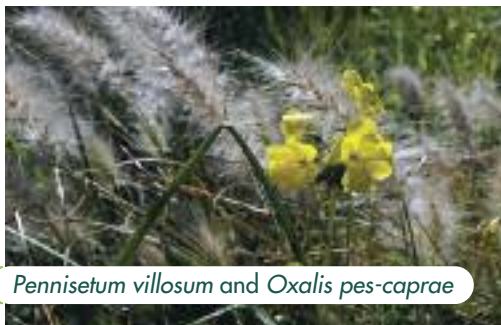
Pennisetum villosum and Oxalis pes-caprae

risk (Heywood, 2011a; Bradley et al. , 2012). Ironically, the very characteristics that make some species attractive for introduction (ease of propagation, fast-growing, adaptable, high reproductive output, resistance to pests and diseases, tolerant of disturbance and a range of environmental conditions) are the same properties that increase the likelihood of the species becoming invasive. Risk assessment strategies may need to be adapted to address this new type of threat.