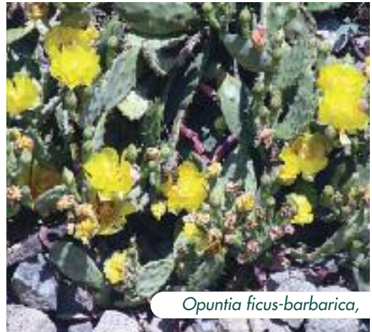
Opuntia ficus-barbarica ,

This Code of Practice should be seen as part of a global strategy on IAS and as a contribution to the Global Strategy for Plant Conservation of the Convention on Biological Diversity.